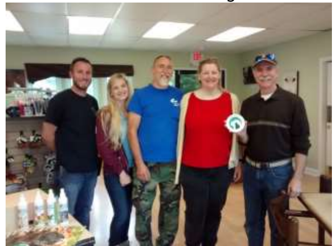
Enjoyed a visit to the Conservator's Center in Mebane. Great people and lion's and tigers and lemurs.....oh my.

General Gov't (I am committee co-chairman)