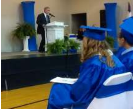
It was my privilege to participate in Burlington Christian Academy's Graduation Ceremony for the Class of 2016. Go Royals!