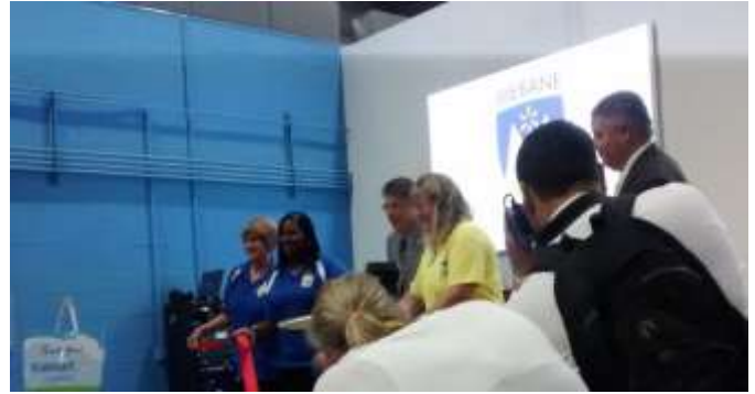
Very glad to have Gov. McCrory in town recently to cut the ribbon at the new Walmart Distribution Center = Jobs

rail tracks, crossing safety, industrial, port and military access and general aviation airports