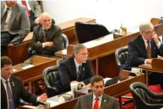
Keeping up with the flow of legislation on the House floor via our on line dashboard

Provides additional screening and personnel security to safeguard critical financial information of state agencies and employees