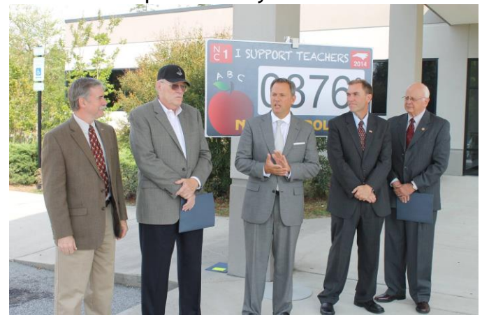
Lt. Gov. Dan Forrest on his recent road trip announcing the new I Support Teachers license plate www.ISupportTeachers.com

2. State Employees & Teacher Compensation - we delivered on our February promise to improve the salary of our beginning teachers. We also were able to expand that promise to include all teachers who on average received a 5.5% increase. State employees received either a $1,000 or $500 increase along with 5 bonus vacation days. One issue of particular importance to me was the extension of the Masters Supplement pay for all teachers who had taken a class prior to July of 2013.