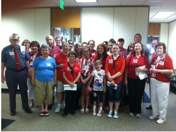
It was a Wonderful Wednesday when the Freedom Works gang came to visit.

One of the highlights of serving in Raleigh is being able to welcome friends from home to their office - Rm 533 in the LOB.