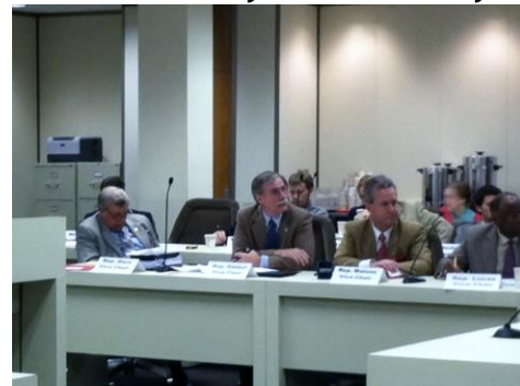
Education Committee Meeting