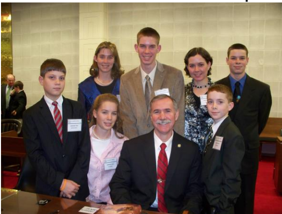
On the floor of the NCGA on Inaugural day with our children.

You sent me to Raleigh to be a strong voice for the hardworking taxpayers, businesses and families of NC House District 64. Some of our conservative reforms were met with wild accusations and misinformation.