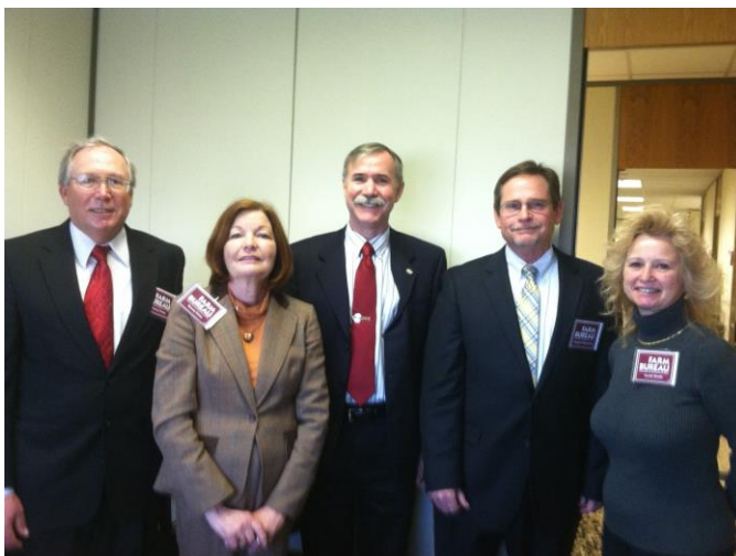
A few members of Alamance County's Farm Bureau team stopped by for a visit.