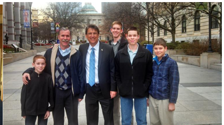
You just never know who you might bump into when you come to Raleigh. I am really proud of the job our Governor Pat McCrory is doing.