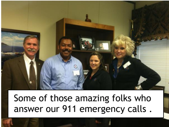
Some of those amazing folks who answer our 911 emergency calls .